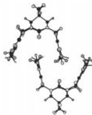
Fig. 1 X-Ray structure showing a dimer of clip 2c

The binding properties of hosts 2 and, for comparison, hosts 1 with a number of hydroxybenzene derivatives ( 4a-f , 5-7 ), were measured by NMR titration experiments in CDCl 3 using the outer wall protons of the host and the aromatic protons of the guest as probes. ¶ The results are summarized in Table 1. The new clip molecules bind resorcinol derivatives significantly more strongly than diphenylglycoluril molecular clips. The binding constant is a factor of three higher for hosts 2a,b when compared to host 1a . || In the case of 2c the increase in binding constant strongly depended on the type of guest used (see Table 1). For guests 4a-c the binding was increased by a factor of three, five and twelve respectively when compared to host 1b . For guests 4d-f the binding constants were so large that they could not be measured by standard NMR titrations. 5 We therefore determined the binding constants of 4d,e by competition experiments with 4c , and of 4f by a competition experiment with 4e . 6 A plot of the binding free energies of guests 4a-f as a function of the Hammett parameter [ \sigma_m (R)] of the guest's substituent (Fig. 2) reveals a linear correlation which has been previously observed for clip 1b . 2b From the gradients of the